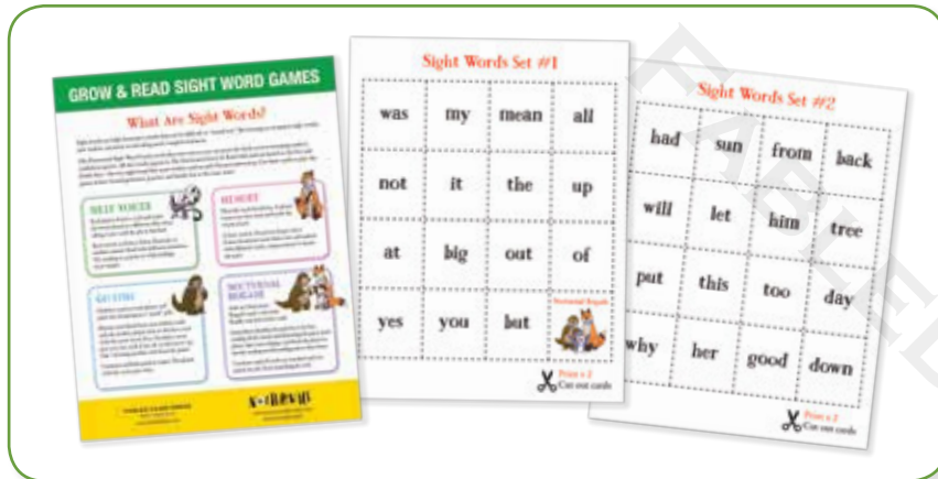
Sight Word Games